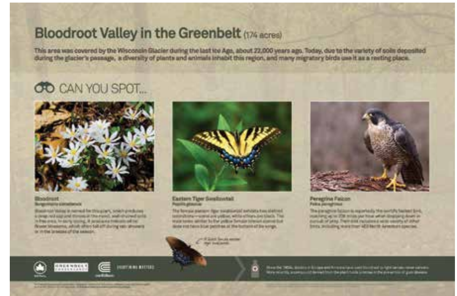
A closer look at an interpretive sign.